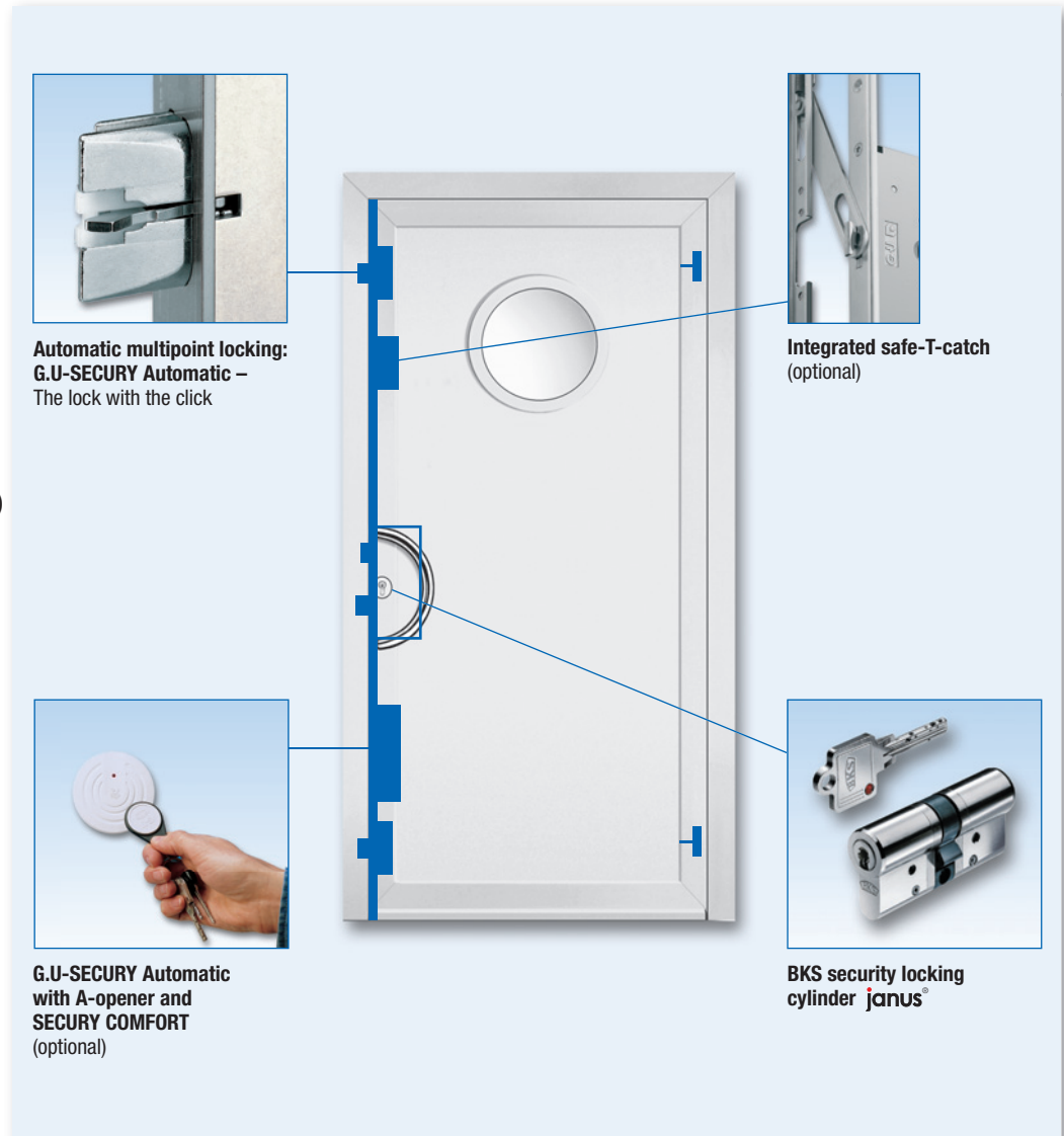
Automatic multipoint locking: G.U-SECURY Automatic – The lock with the click

Moreover, ferGUard*silver meets future EU standards of environment protection already today !